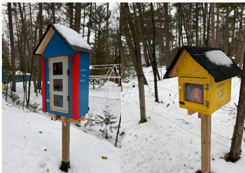
New beach-side community libraries at the second and third Beach entrances.